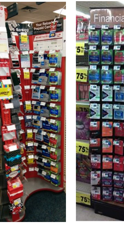
Rite Aid CVS