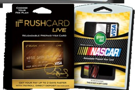
Green Dot Affinity Cards