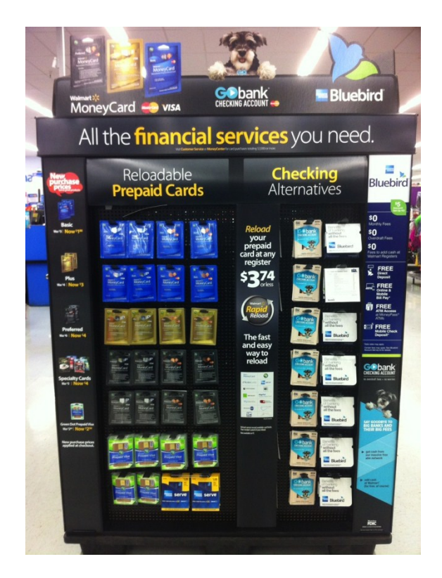
Walmart MoneyCard Destination Cube